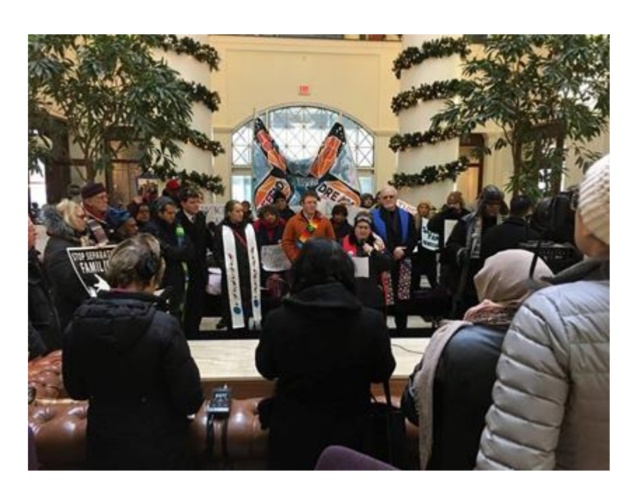
All the Methodists at the front

United Methodist Women has always been in the forefront of social action. Advocating for the rights of immigrants and protection for the Deferred Action for Childhood Arrivals (DACA) was expected.