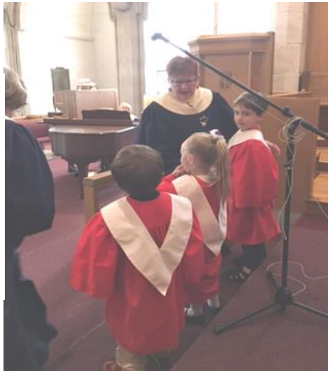
Kids Club Singers ready to sing for Festival of the Christian Home (Mothers Day)