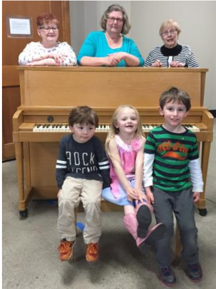
All gathered around the piano at the Kids' Club Banquet